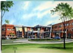
Lutheran Comprehensive Cancer Care Center (see reverse for project features)